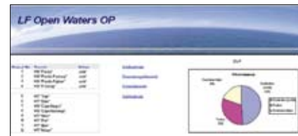
Main page: Overview of ships in the fund

Lloyd Shipping will be extending the application step by step, including additional ship funds in the near future and other funds like real estate and special assets later on.