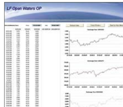
Market data: currency trends

»With Palo OLAP Server, we are in control of the multitude of detail data on our ships and the fund and we can generate valuable, up-to-the-minute information for management. Furthermore, creating customized analyses for the various departments, committees and partner companies is now a very flexible process which is a great plus.«